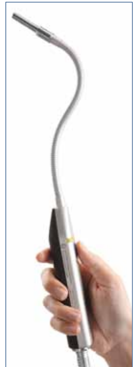
P50 Hand Probe, Flexible neck