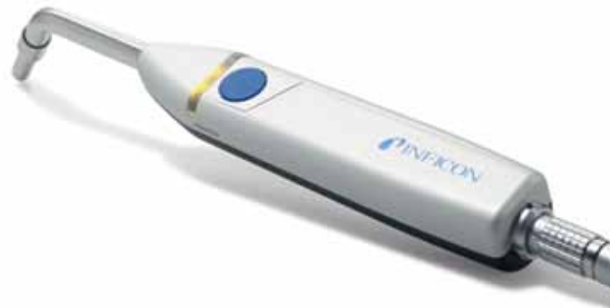
P50 Hand Probe, rigid neck

The P50 Hand Probe, with aluminum handle and steel neck, is an extremely robust tool for demanding applications. Available with rigid and flexible neck, the P50 hand probe is intended for use on Sensistor ISH2000 Hydrogen Leak Detectors. It has built-in intelligence, facilitating the operator's control of the instrument. Easy sensor change allows operators to replace the sensor in a matter of seconds, thus minimizing maintenance cost and time. The ergonomically designed grip informs the operator about which direction the probe tip is pointing, saving time and improving accuracy.