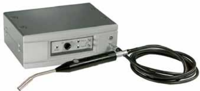
The AP57 Counter Flow Probe module with hand probe unit.